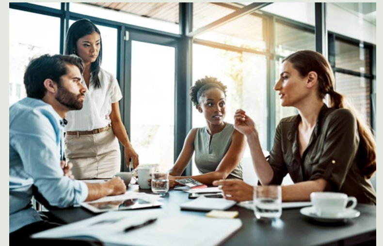
Utilize open floor plans to jump into impromptu brainstorm