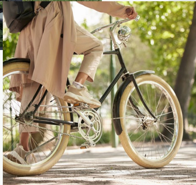
Enjoy a quick, 15-min bike ride to Downtown Mountain View