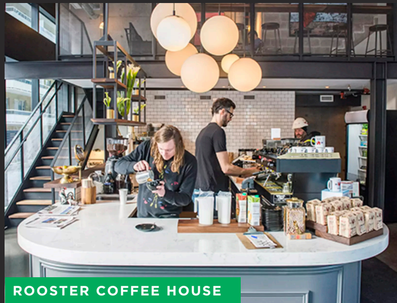
ROOSTER COFFEE HOUSE