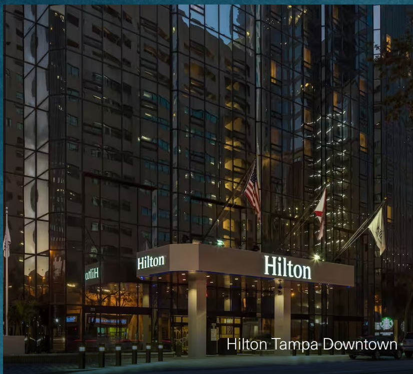
Hilton Tampa Downtown

Connected by covered skybridge, Tampa City Center offers unparalleled access to the hospitality of Hilton Downtown Tampa. Whether hosting out-of-town visitors, taking clients out to lunch or holding large events, the Hilton provides tenants with seamless accommodations.