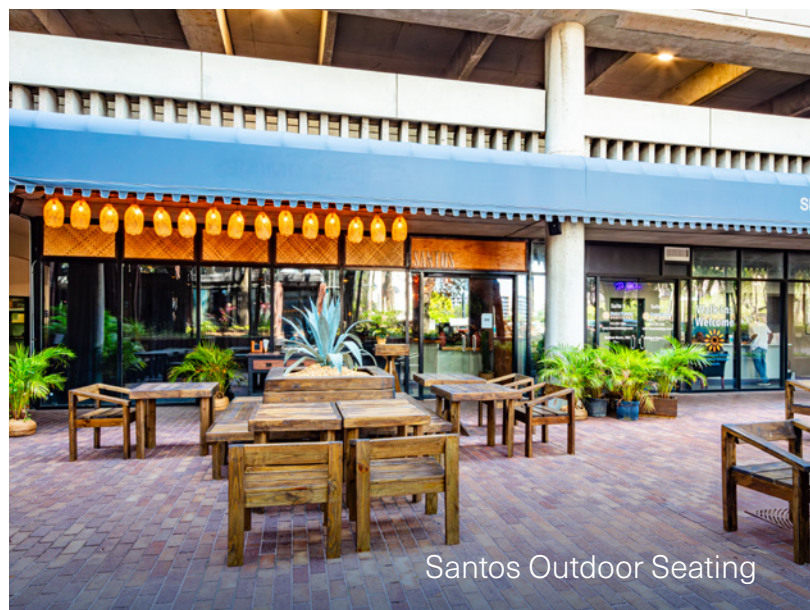
Santos Outdoor Seating