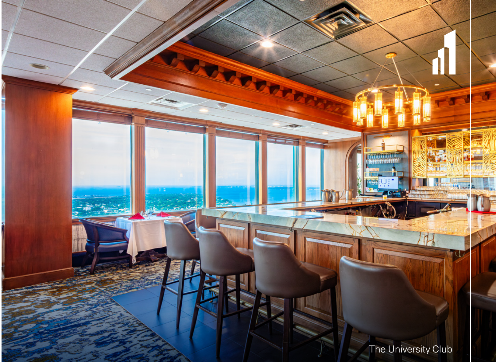
The University Club