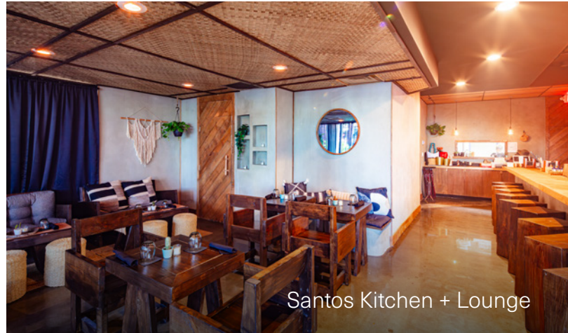
Santos Kitchen + Lounge