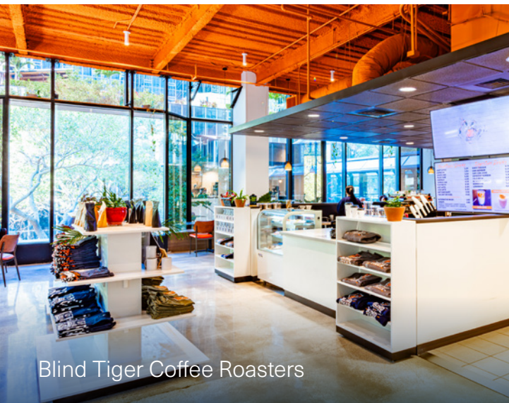
Blind Tiger Coffee Roasters