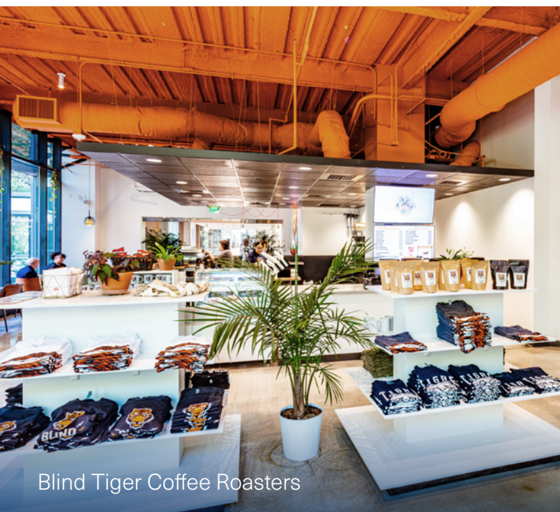
Blind Tiger Coffee Roasters